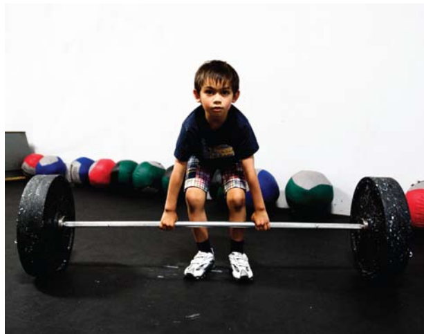
Youngsters should only be introduced to strength training when they're mentally mature enough to follow the instructions that will keep them safe.

The emphasis in the beginning should be on perfecting technique. Don't get caught up in numbers. Master the form and the numbers will come automatically.