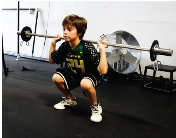
Minor form flaws can be spotted and corrected at an early age, setting children up for a lifetime of safe, effective lifting.

How often should young athletes train? It depends. If they're going to school and participating in a sport or sports, then a couple of times a week with weights