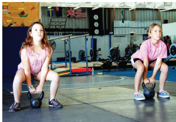
The CrossFit Kids program uses the "angry-gorilla back" cue to help kids learn how to deadlift objects safely.

As the adage states, "An ounce of prevention is worth a pound of cure."