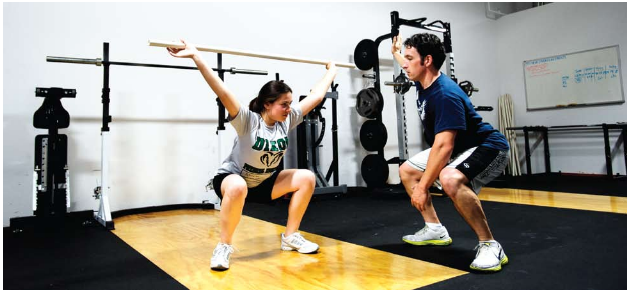
Constant supervision from quality instructors will ensure young athletes correct any faults and train safely.

their muscles and bones. In every farming family, as well as other families whose members did a great deal of physical labor, the sons were always taller and more muscular than their fathers.